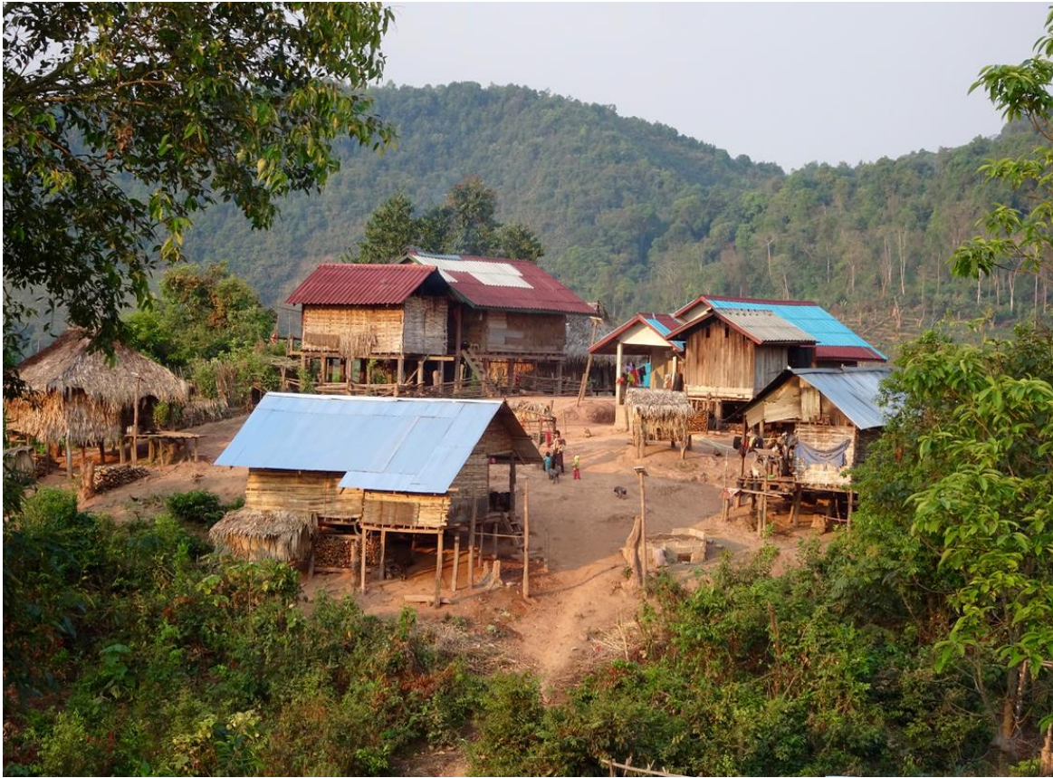
3. An Akka village circled by shifting cultivation (Luang Nam Tha, Laos) (Photo F. Landy, March 2017)