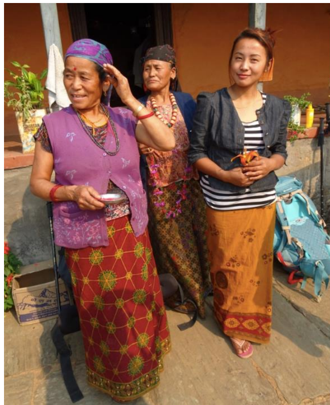
4. A Gurung homestay owner saying goodbye to tourists in Lwang, Machhapuchhre Model Trek (Photo F. Landy, April 2016).