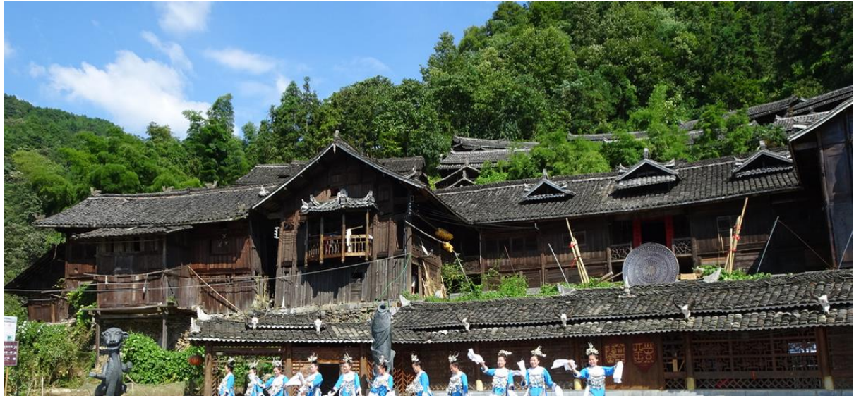
1. Dancing in front of partly “fake old” houses (Gulu village, Guizhou, China)