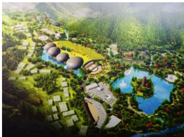
Fig.2. Tourism development plan for Gulu village: of what use is a strong eco-ethnicity?