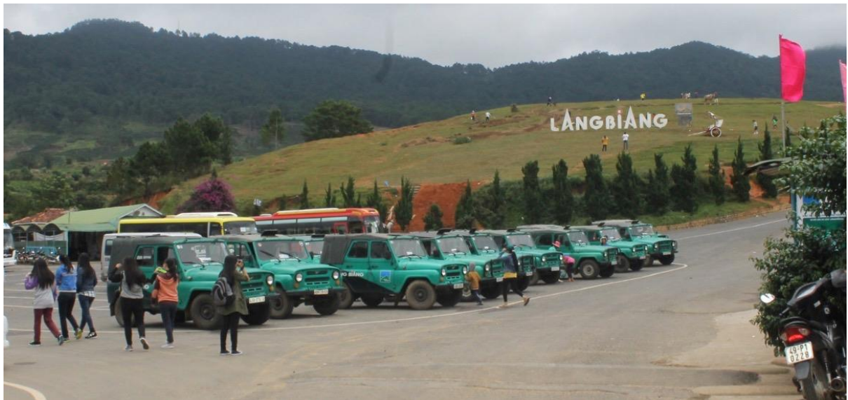
2. Tourists preparing to visit the Langbian mountain (Lam Dong, Vietnam) (Photo S. Déry).