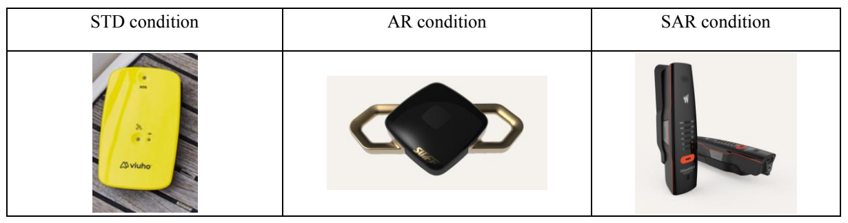
Figure 1: pictures of physical prototypes of the products discussed during the co-design sessions.