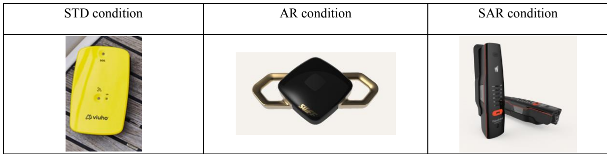
Figure 1: pictures of physical prototypes of the products discussed during the co-design sessions.