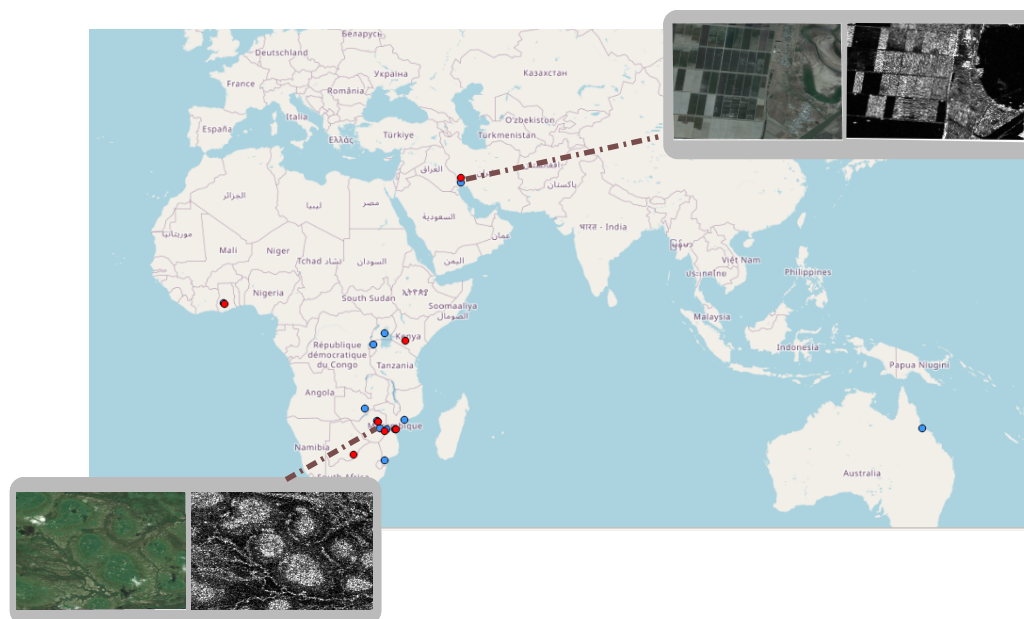
Figure 2. Map of the main areas contained in the dataset. Areas in red correspond to sequences in the training set and areas in blue correspond to sequences in the validation set. Most of the scenes correspond to South East African areas while the rest of the dataset is obtained from West African, Iranian or Australian locations. The behavior of the flood may differ greatly from one area to another: while open water areas appear clearly in SAR images, flooded vegetation or soaked ground areas are harder to discriminate from dry areas.

cloud cover, more SAR images are retrieved for the same time period, leading to a higher sampling rate. This SAR dataset is composed of roughly two times more images than the optical one. To leverage both SAR and optical modalities, we merge the MediaEval dataset and our own in the new SEN12-FLOOD dataset.