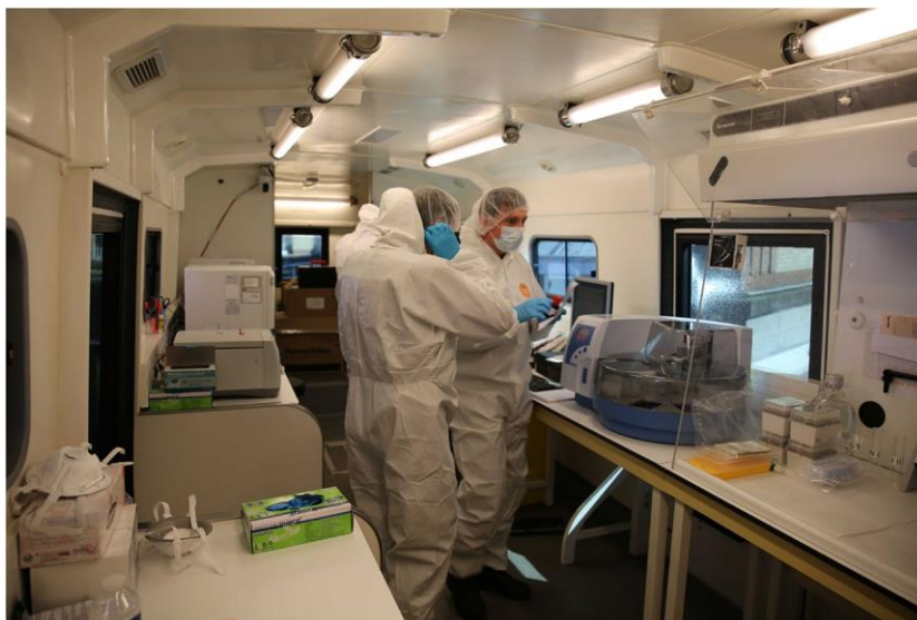
Fig. 1 The Mobil'DNA lab, the adaptation for genetic diagnosis (inside view)

international level. These solutions must interface with clinical diagnostic laboratories to meet the quality standards for medical biology (ISO 15189) [8] and should be mobile to best address the needs. The French National Gendarmerie, as an interior security force serving the protection of the French people, has taken the initiative to adapt the forensic Mobil'DNA. The objective is to propose an autonomous mobile biomolecular laboratory for rapid tests at high-throughput level for the endemic pathogen SARS Cov-2, in support of local hospitals and health systems, in rural or confined areas and overseas.