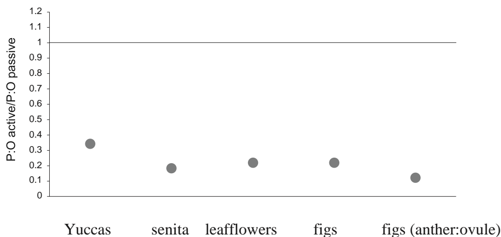
FIGURE 2. Comparison of pollen-ovule (P:O) ratios from actively pollinated taxa and passively pollinated taxa for each major plant group with active pollination. Line represents equality of ratios. nated plant species still produce relatively Actively pollinated taxa have more than a 75% reduction in pollen-ovule ratios.

The copious amounts of pollen production per flower in actively pollinated plant species further highlight the role of additional factors in determining pollen-ovule ratios. For example, sexual selection might contribute to greater pollen production even though transfer efficiency is high in actively pollinated species, similar to the conclusions of Friedman and Barrett (2009). In addition, multiple insects may pollinate the same flower, which could lead to male–male competition for ovules and female choice for pollen quality. Again, deposition of extra pollen grains may be advantageous. There are currently no studies of male–male competition or female choice in any actively pollinated plant species, but such studies could help shed light on the evolution of pollen-ovule ratios in these plant lineages. In addition, there are no data on the longevity of pollen grains once they are collected by the insects, the mortality rates of the pollinators, or the loss of pollen to other insects that may feed on pollen. If pollinators with collected pollen are likely to perish before completing pollen transfer or if the pollen loses viability quickly, this may select for plants that produce more pollen grains than expected based on the pollen transfer efficiency. Similarly, pollen loss due to other biotic or abiotic sources could select for increased pollen production.