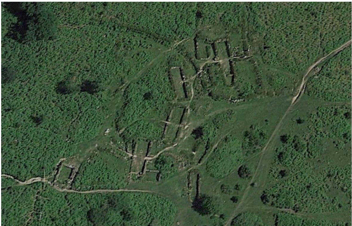
Fig. 2 Example of a deserted medieval village at Hound Tor in Devon, England (photo from Google Earth).