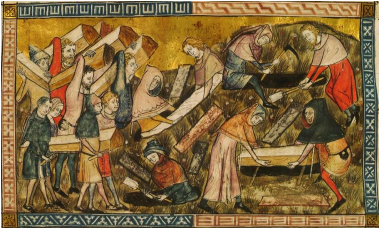
Fig. 1 People burying victims of the Black Death in Tournai, Belgium. Miniature by Pierart dou Tielt illustrating the Tractatus quartus by Gilles Li Muisis (ms. 13076 - 13077 fol. 24v., Tournai, c. 1353).