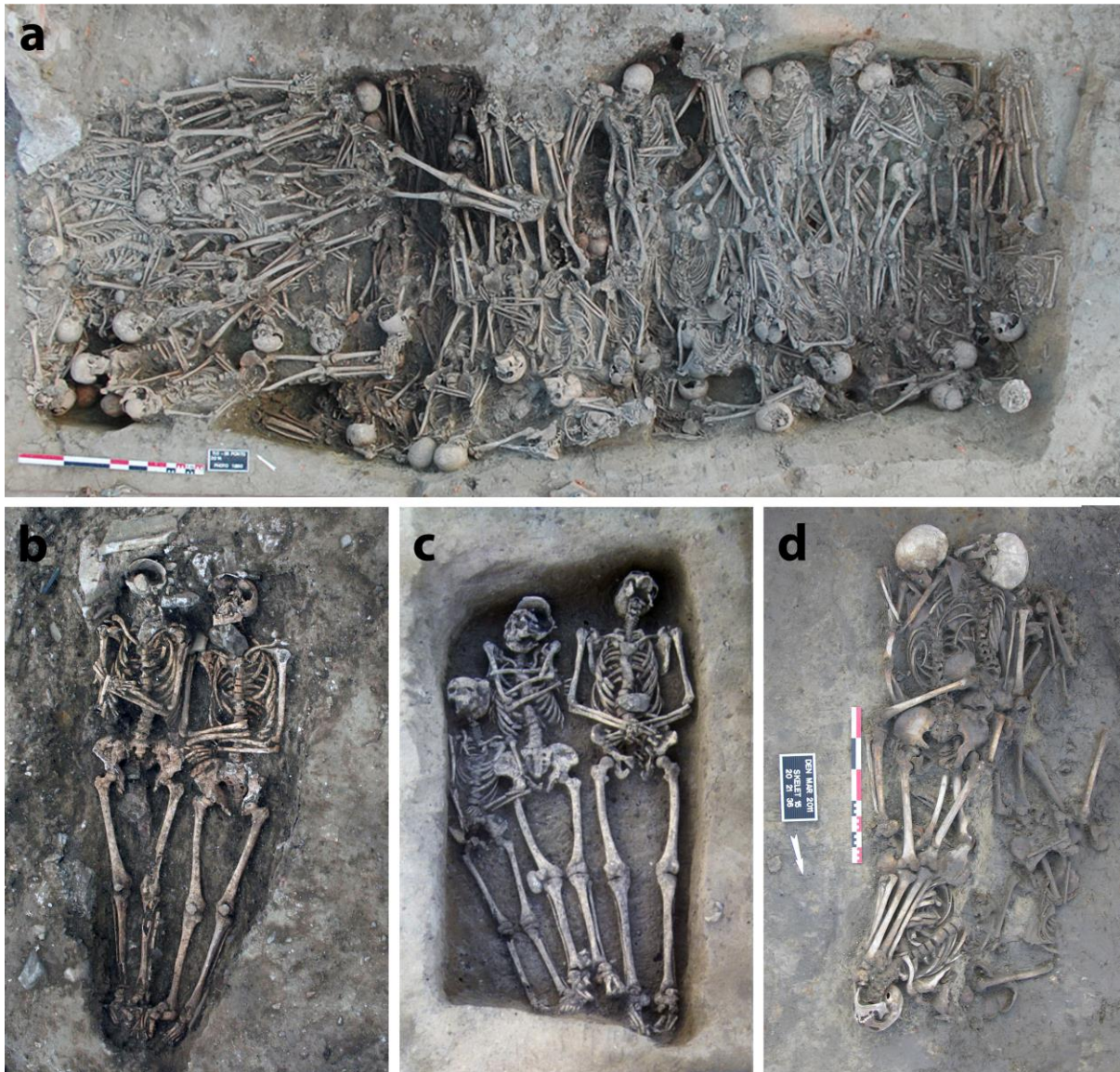
Fig. 3 Multiple burials from Black Death sites at Toulouse (a) and Saint-Laurent-de-la-Cabrerisse (b) and from late-16th century plague cemeteries at Les Fédons (c) and Dendermonde (d).