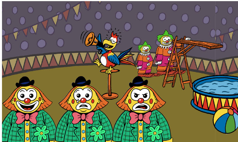
Figure 1 The experimental interface of the EmoHI test. The illustrations were made by Jop Luberti. This image is published under the CC BY NC 4.0 license ( https://creativecommons.org/licenses/by-nc/4.0/ ).