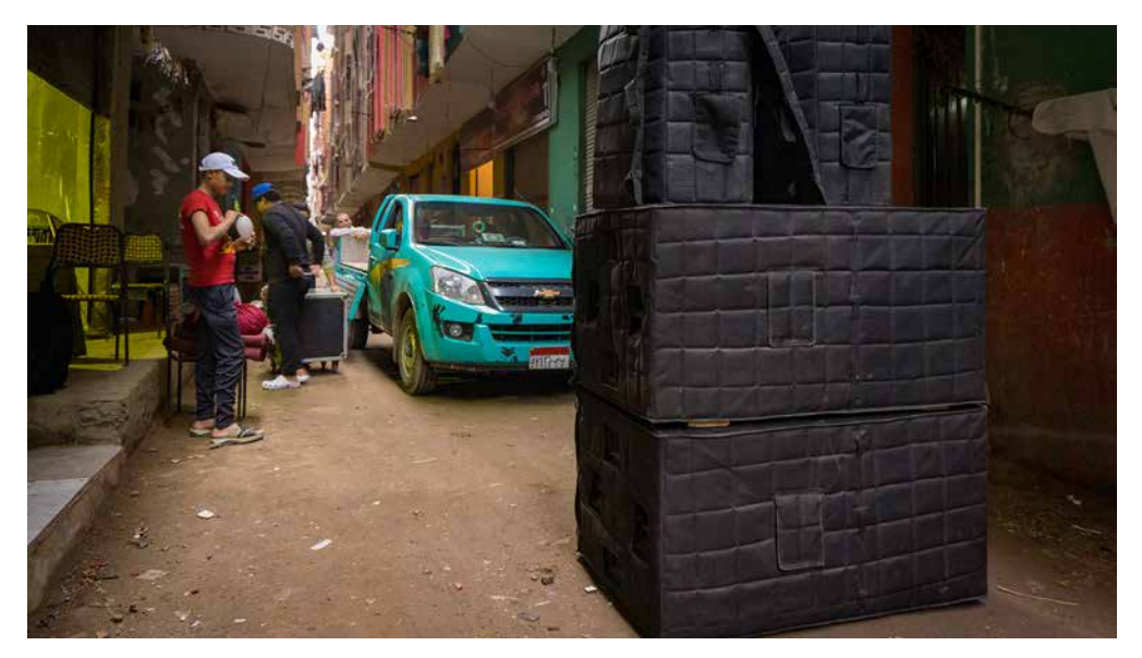
Figure 49.4 Part of a loud sound system unpacked for a birth celebration (subu'), Bashtīl, Cairo, Egypt, 18 November 2016, 4.30 p.m.

My criticism of those sound studies, as an anthropologist concerns the failure to take into account the social and cultural dimension of experience. Many of these studies may not mention the social space in which they are conducted (Figure 49.4): urban informants are subjects of experience, in Taiwan, Los Angeles, Berlin, or Nairobi, it is the universality of their psychological processes towards the sonic world that is the focus of the methodologies deployed.