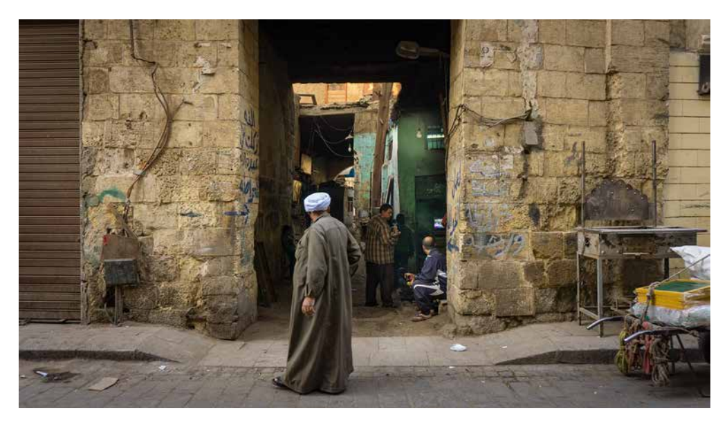
Figure 49.3 In the street of Gamaliyya, Cairo, Egypt, 28 November 2016, 3.00 p.m.

approach is radically different to disciplinary ones as they usually start with a question requiring them to find their methodology rather than the other way around.