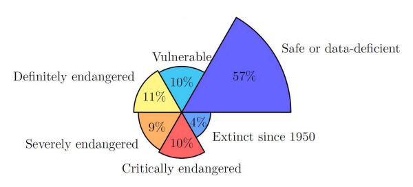
Figure 1: Vitality of the world's languages

There are currently 577 critically endangered languages in the world, making up almost 10% of the world's 6,000+ languages (Moseley, 2010).