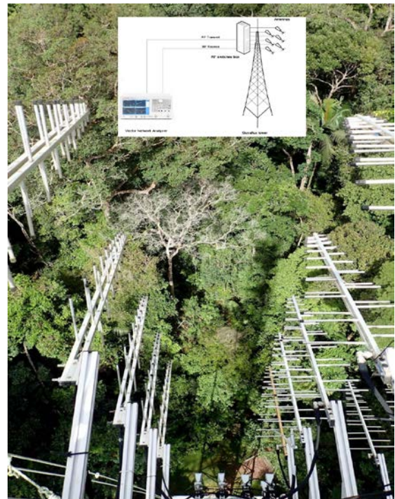
Fig. 1 Picture of the P and L-band antenna array (top) and the C-band antennas (bottom) with a scheme of the tower and the VNA.

channels (VV, HH, VH, HV) and providing a vertical imaging capability (tomography). Measurements cover the two bands 400-600 MHz (P-band) and 800-1000 MHz (low L-band). To extend the measurements to C-band, a new Vector Network Analyzer (VNA) (Rhode&Schwarz ZNL-6, see www.rohde-schwarz.com ) has been installed. Six new antennas dedicated to the C-band have been also set up at the VV polarization and equally split between the west and the northeast sides of the tower (see Fig. 1). C-band acquisition is segmented into three sub-bands of 200 MHz starting from 5.2 GHz (to be named A, B, C). Full acquisition cycles are performed every 15 minutes thanks to the radio frequency switches that sequentially route the signal between each receive-transmit pair and the VNA.