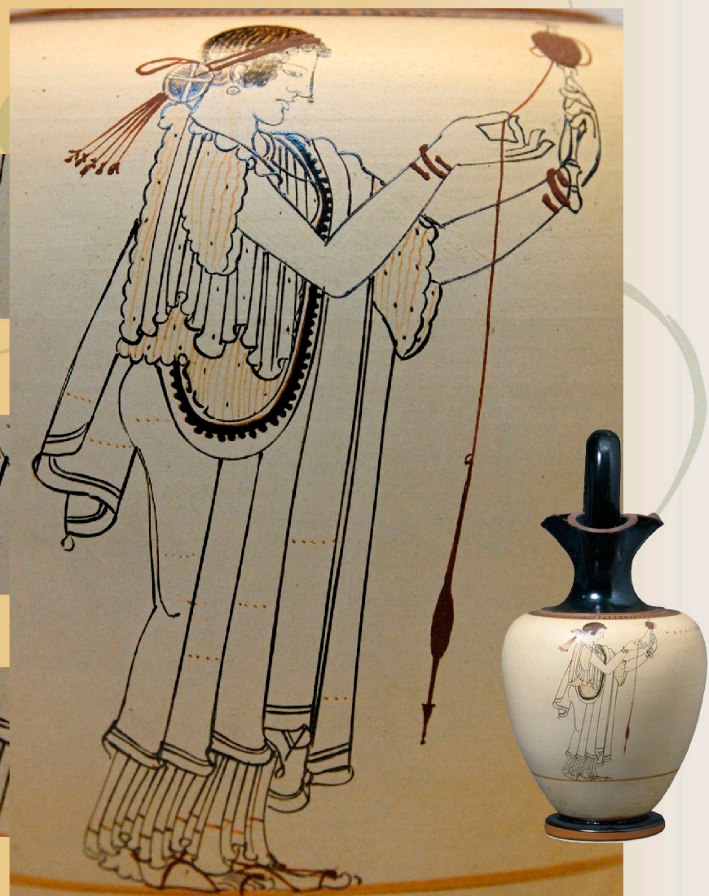
Woman spinning, detail of an Attic oinochoe white background Brygos Painter, circa 490 BC. British Museum