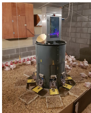
Individual feeding device for group-housed broilers