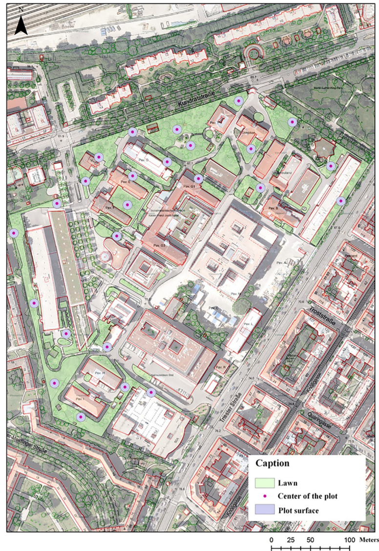
Fig 2. Detailed map of the studied site with plot positions.

https://doi.org/10.1371/journal.pone.0225347.g002