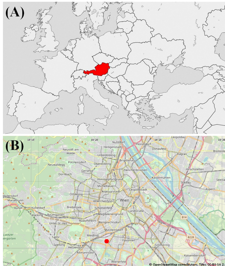
Fig 1. Location of the study site in Europe (A) and in Vienna (B). (A) Location of the country of study (B) Location of the study site in the city of Vienna.

https://doi.org/10.1371/journal.pone.0225347.g001