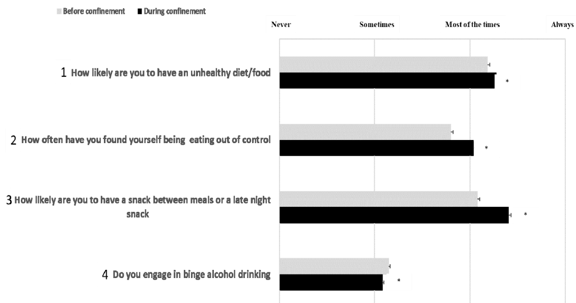
Figure 1. Participants' scores in response to the related diet behaviour questions. *: Significant differences between "before" and "during" COVID-19 home confinement period.

Recorded scores in responses to the diet behaviour questionnaire before and during home confinement are presented in Figure 1 (question 1 to 4) and 2 (question 5). For detailed distribution of responses (in %), please see Table S1 (Supplementary File).