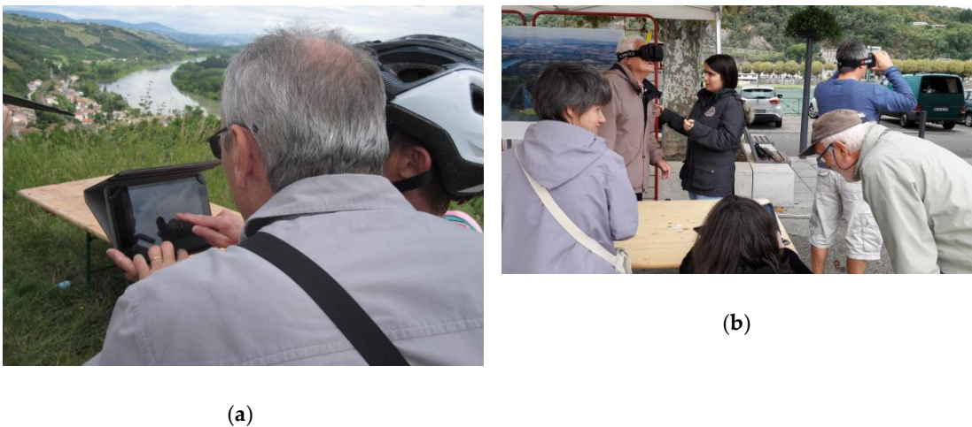
Figure 6. Pictures taken during the events: (a) shows inhabitants consulting the 3D geovisualization with a tablet from a high vantage point (same viewpoint as the one selected for the images of the simulated flood they are visualizing); (b) shows inhabitants using the VR headset (background), while another is being shown the tablet by a mediator (foreground).

All those visuals were imported on tablets to be used by risk managers to explain the flooding phenomenon on the area and to be consulted by inhabitants. The 3D scenes (cf. Figure 5) were imported on smartphones to be visualized with virtual reality headsets on site (i.e., on the site corresponding to the 3D scene). Figure 6 shows some pictures that were taken during the events.