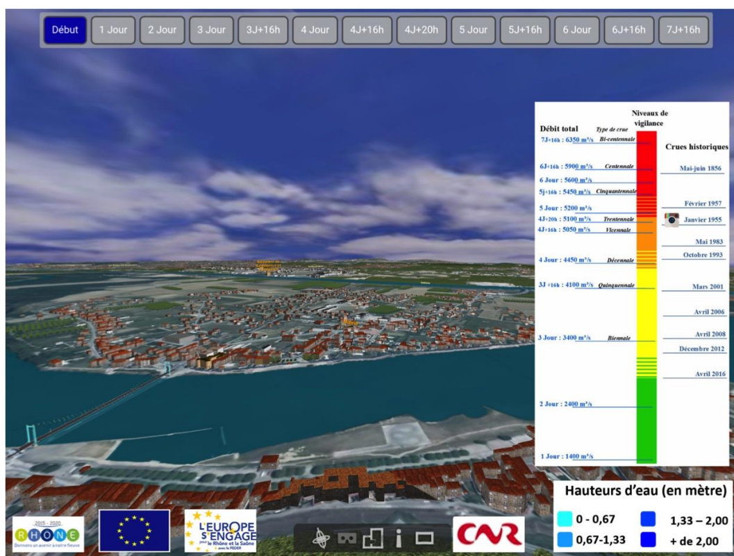
Figure 4. Interface proposed to the public on tablets for the visualization of the simulated flood from a chosen point of view. At the top is a temporal navigation panel to choose a point in the timeline of the simulated flood. On the right is a panel that can be hidden or displayed and that provide a link between water flow (m 3 per second) and historical floods that have occurred on the territory. It also enables the user to access historical pictures for some historical floods. At the bottom is a spatial navigation panel to go to the left or right, look up or down and zoom in or out. The information tool gives more details on how the flood was simulated.