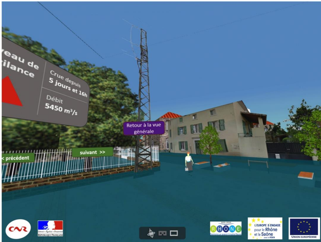
Figure 5. Example of the 360° images produced for immersive visualization (with a smartphone inserted into a virtual reality (VR) headset). Purple and green panels can be used to navigate between different moments in time (during the simulated flood). Grey panel gives information about water flows ( m^3 per second), point in time (number of days since the beginning of the flood), and the corresponding level of vigilance (here red).

All those visuals were imported on tablets to be used by risk managers to explain the flooding phenomenon on the area and to be consulted by inhabitants. The 3D scenes (cf. Figure 5) were imported on smartphones to be visualized with virtual reality headsets on site (i.e., on the site corresponding to the 3D scene). Figure 6 shows some pictures that were taken during the events.