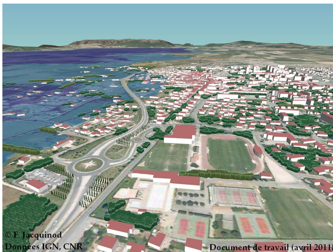
Figure 1. Aerial view from a 3D geovisualization of a district impacted by a simulated flood. Image prepared by F. Jacquinod from data from IGN and CNR.

Schematic 3D models were produced from a digital elevation model (2 meters resolution), an orthoimagery (50 centimeters resolution), extrusion of buildings from the IGN BD TOPO® (2.5D modelling), and sometimes a schematic representation of a selection of the site's vegetation (mostly a few individual trees, well known from the inhabitants and textured polygons from large areas of vegetation and typical hedges). Then, hydraulic data was added through water heights map represented in 2D colored polygons and through a transparent 3D volume. A few landmarks, considered by local risk managers as useful points of references for elected representatives and inhabitants to orient themselves in the 3D geovisualizations, were added through 3D objects (for instance, a particular dam, windmills, quarries, etc.). Figure 1 shows a typical result (aerial view). Figure 2 shows two examples of views showing the 3D representation of water flows through a 3D transparent volume.