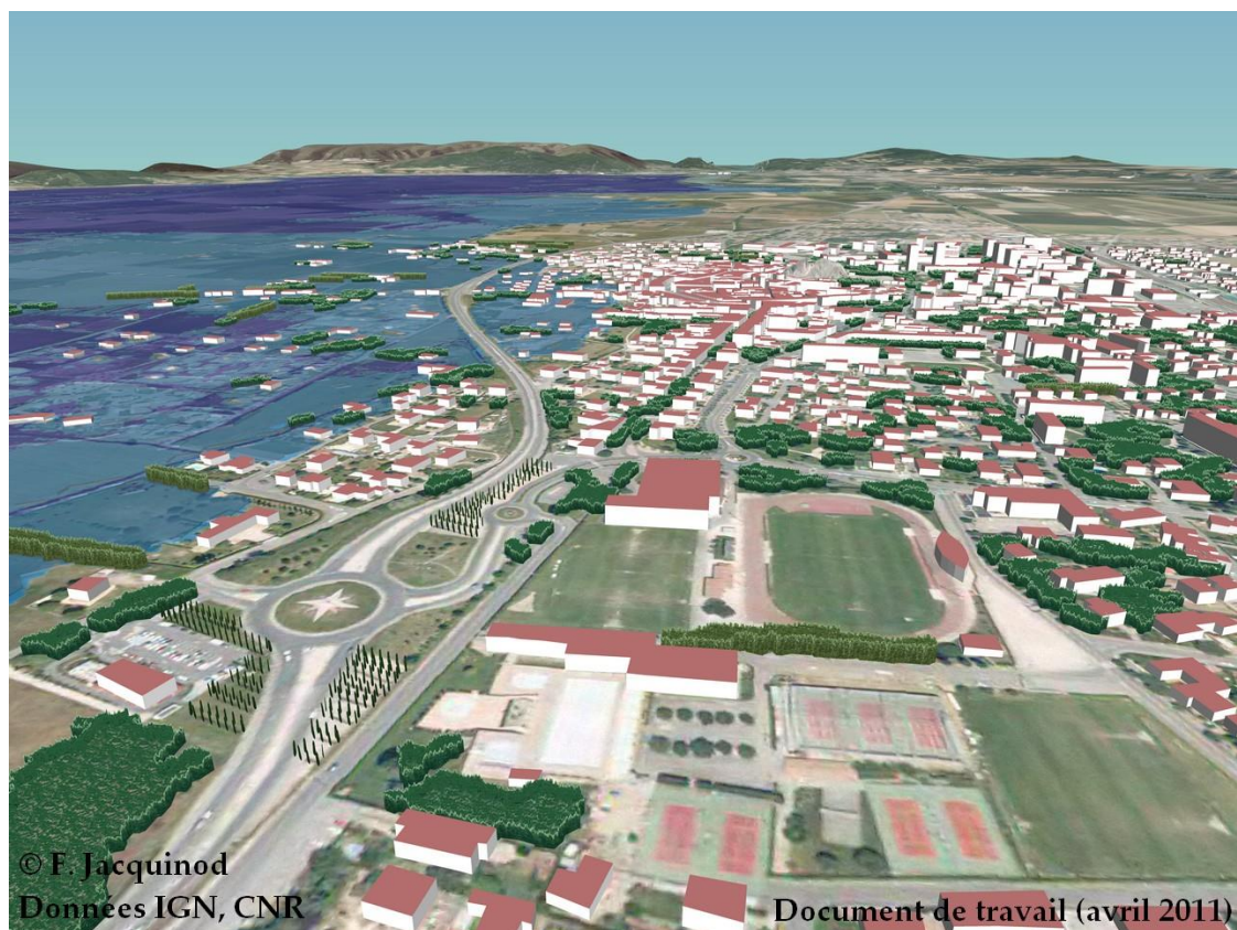
Figure 1. Aerial view from a 3D geovisualization of a district impacted by a simulated flood. Image prepared by F. Jacquinod from data from IGN and CNR.

Schematic 3D models were produced from a digital elevation model (2 meters resolution), an orthoimagery (50 centimeters resolution), extrusion of buildings from the IGN BD TOPO® (2.5D modelling), and sometimes a schematic representation of a selection of the site's vegetation (mostly a few individual trees, well known from the inhabitants and textured polygons from large areas of vegetation and typical hedges). Then, hydraulic data was added through water heights map represented in 2D colored polygons and through a transparent 3D volume. A few landmarks, considered by local risk managers as useful points of references for elected representatives and inhabitants to orient themselves in the 3D geovisualizations, were added through 3D objects (for instance, a particular dam, windmills, quarries, etc.). Figure 1 shows a typical result (aerial view). Figure 2 shows two examples of views showing the 3D representation of water flows through a 3D transparent volume.