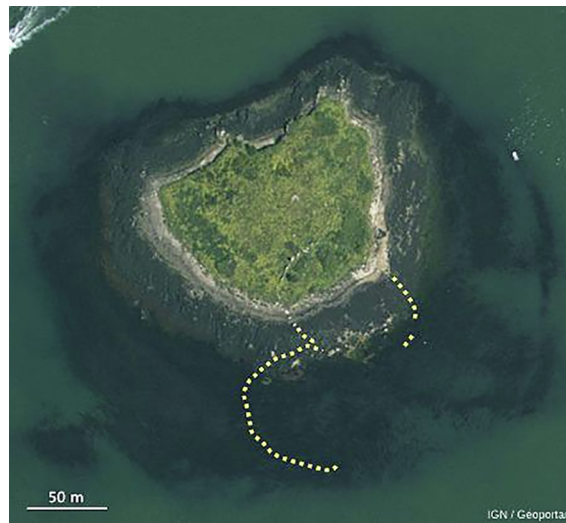
Fig. 2. Illustrated aerial view of the double cromlech of Er Lannic, a geo-social chronotope ((Thomas, 2015) – © 2015 IGN/Géoportail, modified to show the location of submerged parts (Burl, 1995, p. 256)).