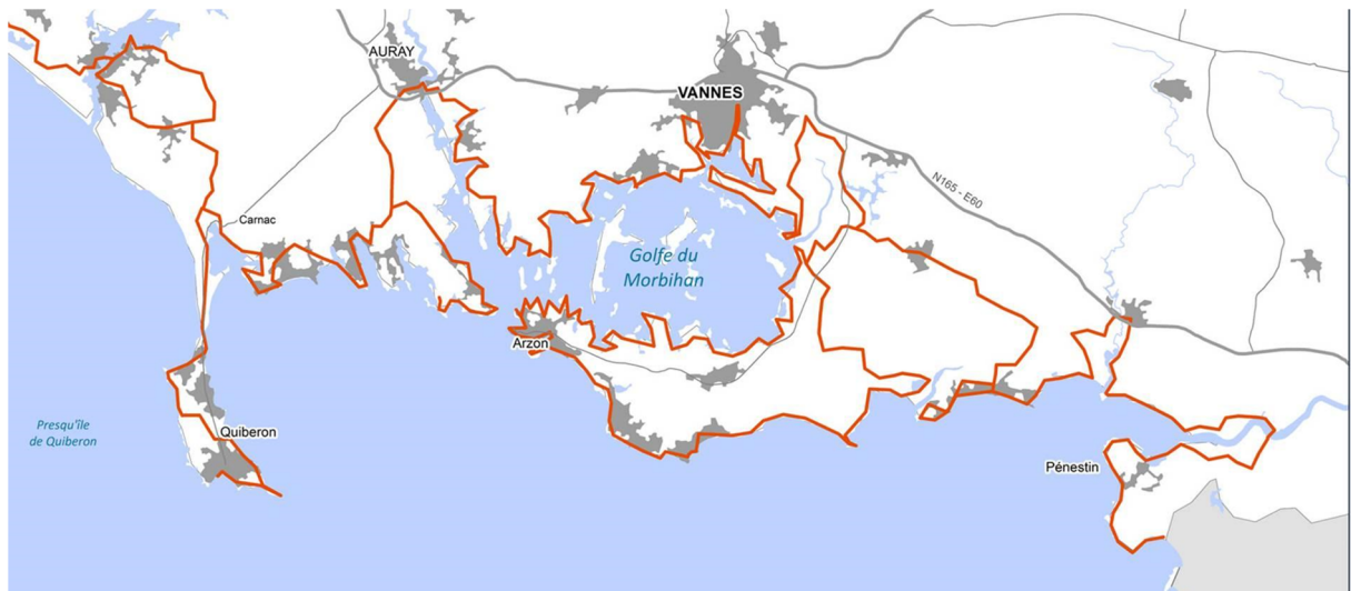
Fig. 3. The coastal pathway (GR34) around the Gulf of Morbihan.

center of the island to the southern shores. Today, only the northern circle is still visible although it is partly submerged at high tide while the southern one is totally under water. Several theories have been put forward to explain the presence of the two stone circles. The northern one could have been built during the rising of the waters, partially reusing menhirs from the southern one as it was being immersed. Alternatively, the southern hemicycle could have been a symbolic bulwark against the ocean to ward off the rising waters (Mohen, 2009; Sévère and Lorin, s.d.). Anyway, this cromlech clearly illustrates the rise in sea level during the Neolithic period, and acts as a symbol for the forthcoming increase.