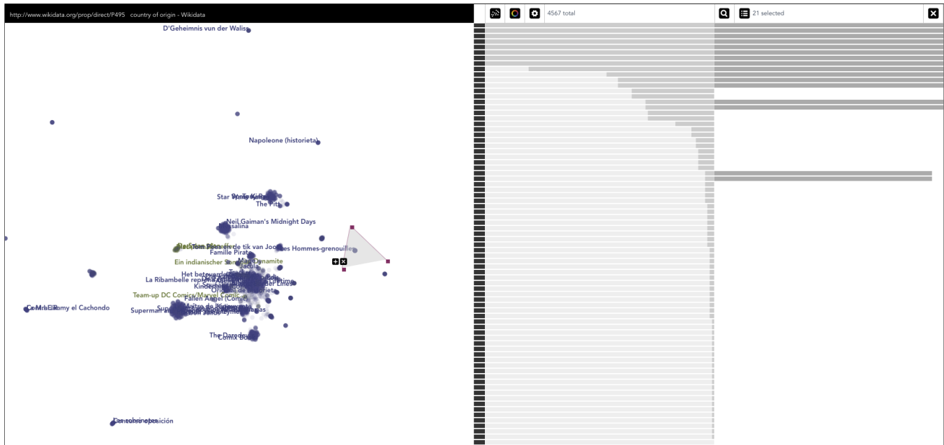
Figure 1: The Missing Path lets users identify subsets of items missing the same attributes and inspect them to find the cause of incompleteness. Dense groups of points (clusters) represent entities that share a large number of paths, meaning that they are structurally similar up to some specified path length (2 in this example). Isolated entities are therefore structurally different than others and probably inconsistently encoded. The presence of multiple clusters indicates the existence of groups of entities that are slightly different structurally, either for good reasons or because they have been entered in an inconsistent manner. With our tool, all these issues can be checked and collected for further corrections.

Marie Destandau Jean-Daniel Fekete Marie.Destandau@inria.fr Jean-Daniel.Fekete@inria.fr Université Paris-Saclay, CNRS, Inria, LRI Orsay, France