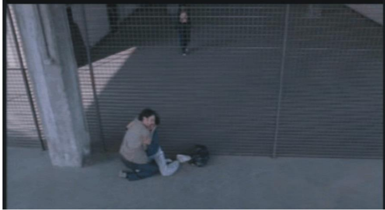
The end. The detention center for illegal immigrants