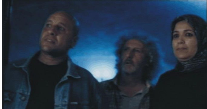
The bar owner between his wife and his employee