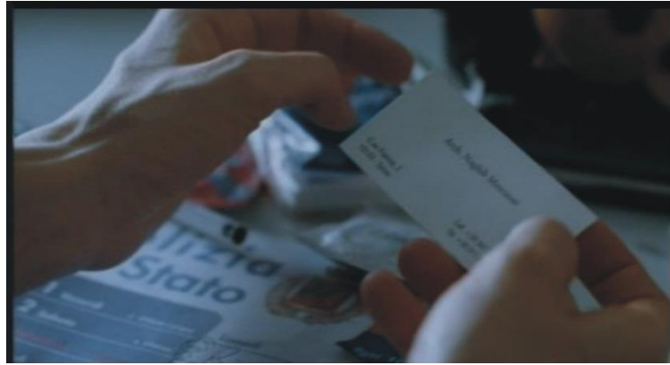
The architect's card

Once again, the revealed identity leads to an unexpected turnover, missing in the novel: while the architect is trying to find Amina, who has disappeared, their stories intersect again thanks to a phone call made by the police woman who had arrested Amina. From that moment, the movie's rhythm changes and speeds up, there are no more flashbacks: the viewer shares the characters' present time and their fight against exclusion. The game does not stop for the architect: the only scheme he can imagine to enter the detention center for illegal immigrants is to give up his own identity. He has no more name, only the face of someone born elsewhere.