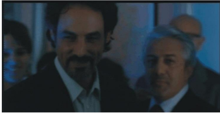
Reception in the architect's office 8

Such changes introduced by the director activate a subtle game inviting the viewer to wonder which person is the real stranger and in the eyes of whom. Feeling like a stranger is part of the migratory experience; it has often been described in the literature of many countries and in numerous cinematographic sequences. It has also been depicted in Italian literature and cinema as it has been experienced by many Italian immigrants for the last two centuries in many towns and villages and streets, all over the world, from Marseilles to New York, Buenos Aires, São Paulo, in Australia, etc.