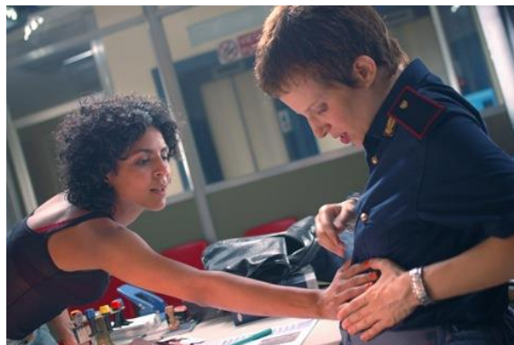
Amina and the policewoman

Other boundaries disappear thanks to the police woman, played by Sonia Bergamasco. Amina's interrogation is a sort of puzzle game in which the various pieces are alternatively shown. The flashbacks and the same story told from Najib's point of view change the ordeal into a friendly give-and-take. The two young women exchange their experiences and hopes about love and motherhood. They also achieve together the limits of illegal complicity: Amina is left alone for a while. She thinks she can understand that she has the possibility to escape, even if the whole sequence is ambiguous. Nevertheless, there is no doubt about Najib and the police woman's complicity when the architect manages to be locked up in the detention center for illegal immigrants in order to meet Amina, about to be expelled from Italy.