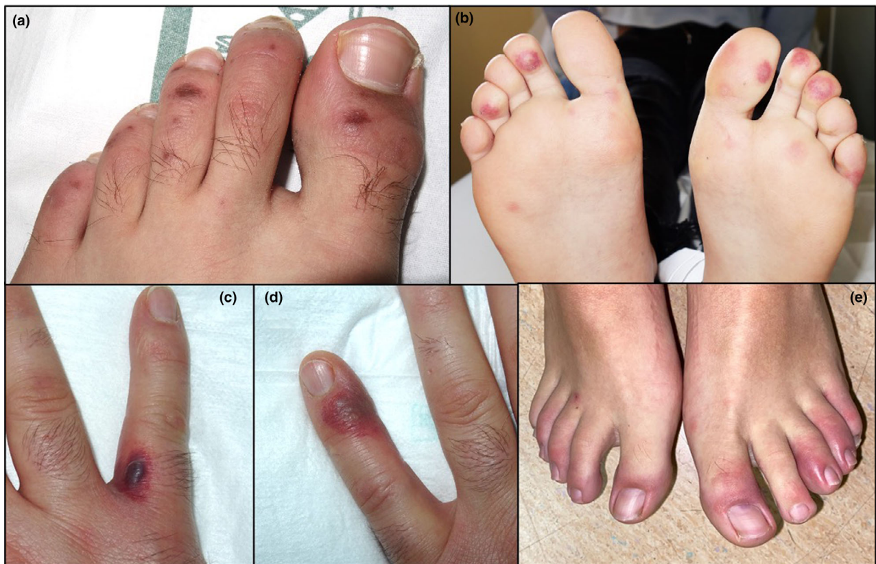
Figure 1 Acral lesions in patients with negative nasopharyngeal PCR and serology for COVID-19: (a) Petechial and purpuric macules on the dorsal aspect of the toes in a 19-year-old male. (b) Erythematous lesions with purpuric hue and digital swelling on the distal aspect of the toes in a 13-year-old female. (c, d) Purpuric macules with haemorrhagic vesicle on the fingers of a 41-year-old male. (e) Erythema and oedema on multiple toes in a 19-year-old male.

Given their potential association with COVID-19, acral lesions have received special attention worldwide, both in the medical literature and the media. Our aim is to share our