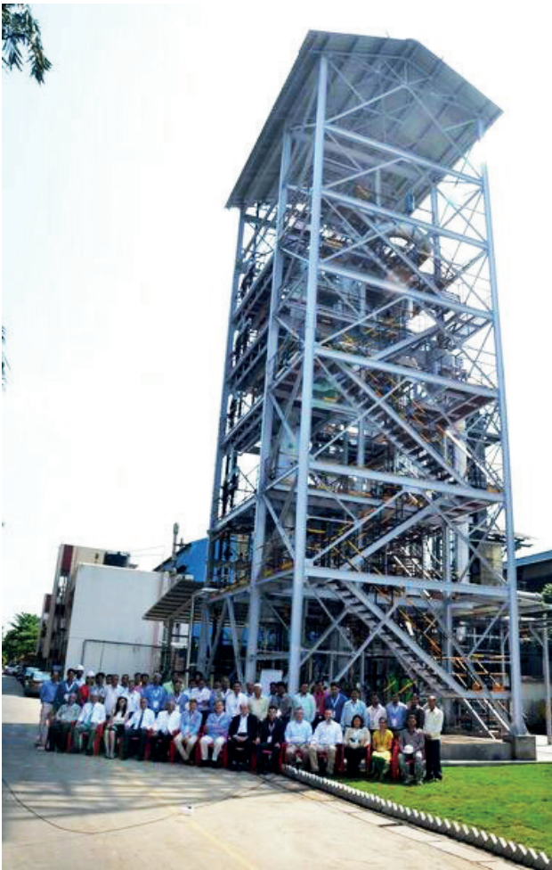
FIGURE 1: 1 MWth circulating fluidized bed solid fuel gasification facility developed during the FP7 OPTIMASH project (2011-2016).

and converted to heat and power in gas engines. The most critical and innovative part of this system is obviously the gasification reactor. Its design criteria are based on our knowledge, experience and expertise in the gasification area. The circulating fluidized bed gasifier uses a mixture of preheated air and steam as the gasification agent. A global layout of the gasification facility is presented on Figure 2.