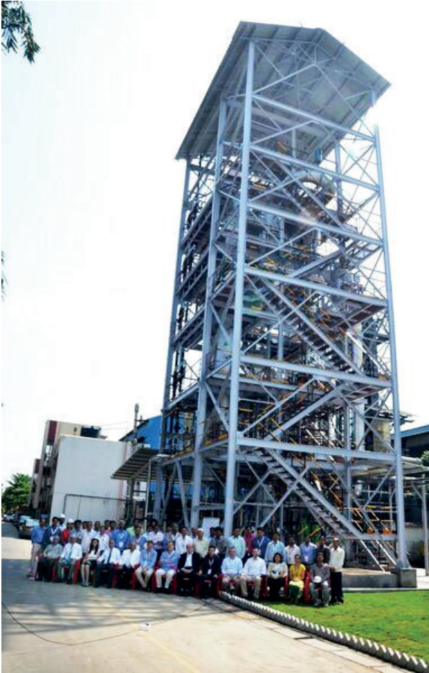
FIGURE 1: 1 MWth circulating fluidized bed solid fuel gasification facility developed during the FP7 OPTIMASH project (2011-2016).

and converted to heat and power in gas engines. The most critical and innovative part of this system is obviously the gasification reactor. Its design criteria are based on our knowledge, experience and expertise in the gasification area. The circulating fluidized bed gasifier uses a mixture of preheated air and steam as the gasification agent. A global layout of the gasification facility is presented on Figure 2.