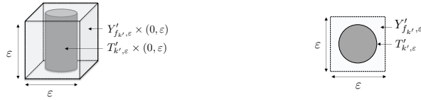
Figure 2: View of the 3D reference cells Y_{k',\varepsilon} (left) and the 2D reference cell Y'_{k',\varepsilon} (right).

The fluid part of the bottom \omega_\varepsilon \subset \mathbb{R}^2 of a porous medium is defined by \omega_\varepsilon = \omega \setminus \bigcup_{k' \in \mathcal{K}_\varepsilon} \bar{T}'_{k',\varepsilon} , where \mathcal{K}_\varepsilon = \{k' \in \mathbb{Z}^2 : Y'_{k',\varepsilon} \cap \omega \neq \emptyset\} . The whole fluid part \Omega_\varepsilon \subset \mathbb{R}^3 in the thin porous medium is defined by (see Figure 3)