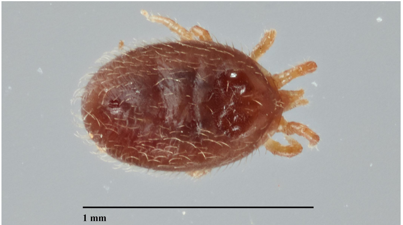
Figure 3 One of the four engorged females of Ophionyssus natricis that were collected from a sleepy lizard ( Tiliqua rugosa ) on 17 August 2019 at the study site surrounding the Bunday Lutheran Church ruins in the Mid North of South Australia.

(Sih 2017, personal observation ). The study site typically experiences rainfall of less than 300 mm during late winter to early summer (August to December) (Kerr and Bull, 2004) and the only record of Op. natricis at the study site in 2019 was in mid-August when the study site was experiencing a severe drought, which lasted throughout the time the study was conducted. It is therefore possible that no other instances of mite infestation were found at the study site because the mite population in this area may have been drastically reduced or may even have died out due to desiccation stress. It is therefore recommended that follow up investigations be done during non-drought periods to verify the status and distribution of this snake mite population.