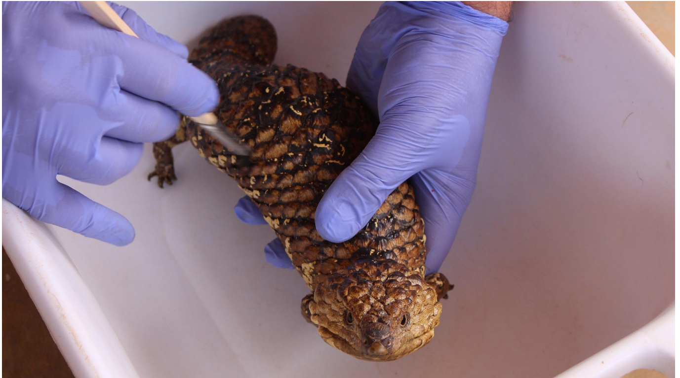
Figure 1 The sleepy lizards ( Tiliqua rugosa ) were checked for mite by holding them within a plastic container and brushing the areas under their scales with a fine paintbrush (photographed by Jessica Clayton).

this parasite, 52.9% were animals in captivity and of the 24 records of snakes as hosts, 62.5% were animals in captivity. One record was of mite that were collected from the environment.