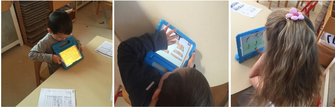
Fig. 1. Three different operational patterns on the tablet.

recorded children's direct reflection and natural behavior in front of an iPad until the children asked help from us showing in Fig. 1, and the instruction is also step by step according children's progress and feedback for the game. In the start of the game, researchers are responsible to set the difficulty for the children based on the child's performance last time from the record.