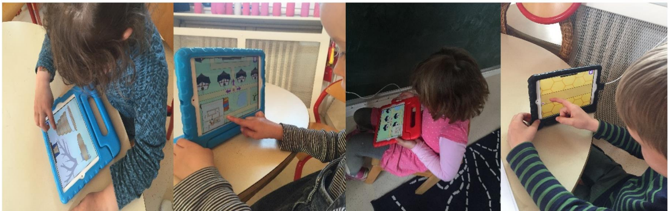
Fig. 3. Typical mistakes made by children.

she insisted to use drag and drop way and she didn't notice that and felt so confused and a little disappointed. For the third child, she is pretty familiar with using a tablet and she passed the first two tasks in this game much faster than the others but when it came to the third part, she try to tilt the tablet to move the figure in the game just the same as what she did in the first two task and she failed of course. For the fourth child, he is an elder boy, when he first tried to pass the task, he didn't understand he should tilt the tablet and he insisted to use the finger to drag and touch, the figure moved really so slowly.