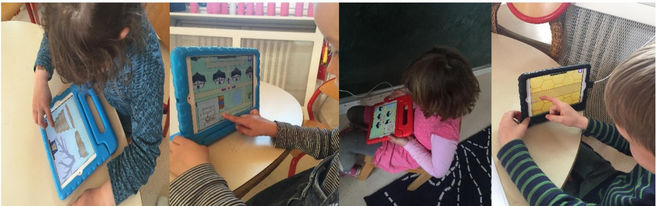
Fig. 3. Typical mistakes made by children.

she insisted to use drag and drop way and she didn't notice that and felt so confused and a little disappointed. For the third child, she is pretty familiar with using a tablet and she passed the first two tasks in this game much faster than the others but when it came to the third part, she try to tilt the tablet to move the figure in the game just the same as what she did in the first two task and she failed of course. For the fourth child, he is an elder boy, when he first tried to pass the task, he didn't understand he should tilt the tablet and he insisted to use the finger to drag and touch, the figure moved really so slowly.