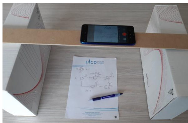
Figure 1 : Photograph of the video recording equipment

95 Thus, to explain the solutions of the exercises or to remind students of course notions that they have not mastered properly, one needs to launch the video acquisition and start talking while having the possibility to draw molecules on the paper as one could do on a blackboard in the classroom. This solution, close to the Khan-style video format, 9 has the advantage of not using a graphics tablet or any other expensive and potentially inaccessible accessory during the lockdown.