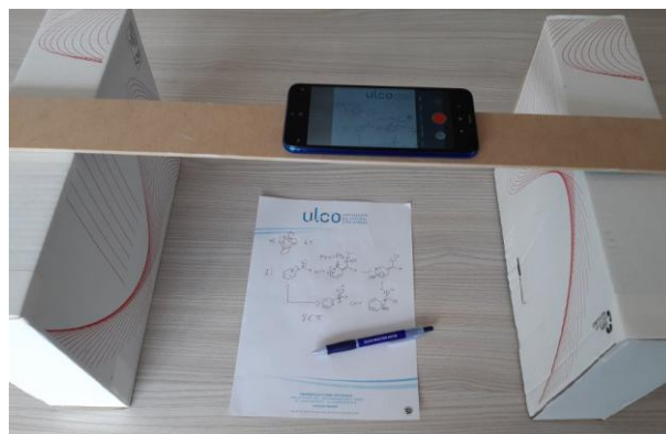
Figure 1 : Photograph of the video recording equipment