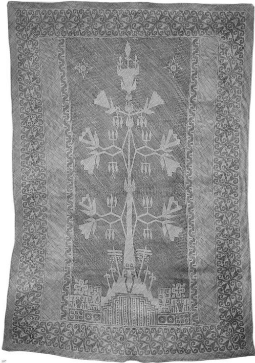
Fig. 6. Ritual rattan mat with the tree of life pattern, referring to the myth of creation of the world (l. 200 cm); Ngaju people.

However, a far cry from the mundane, certain plaited artifacts – mats, hats, baskets – carry whole pictorial narratives about mythical heroes, spirits, and godly characters, with profound social and ritual significance. Such patterns certainly possess marked symbolic value, since these artifacts are created for ritual reasons, and are in use or in attendance during religious festivals (Fig. 6) (see, e.g., Maiullari 2011 and Klokke 2012 for the Ngaju, Couderc 2012 for the Uut Danum (or Ot Danum), Sellato 2012 for the Kenyah and the Aoheng).