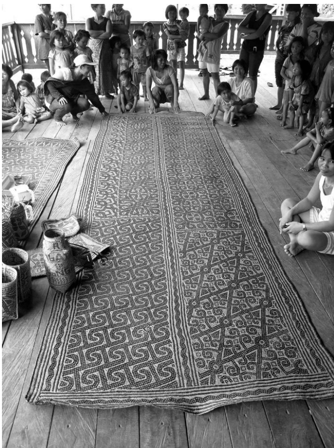
Fig. 4. Long sitting mat showing separate panels with various geometric patterns; Tingalan (aka Agabag) people.

Local taxonomies of basketry, often related to the division of labor, are based on a combination of criteria of form, function, material, and technique. For example, from a standard “design-type” (see, e.g., Niessen 2009), the large sunhat ( cahung ), the Aoheng provide a finer designation by a second-order term identifying the material ( cahung da'a , “sunhat of pandanus”), the presence of decoration ( cahung karung , “sunhat with pattern”; see Fig. 2), the wearer’s gender ( cahung laki , “sunhat for men”), or specific function ( cahung adet , “sunhat for rituals”; Sellato 2012; see also Maiullari 2011).