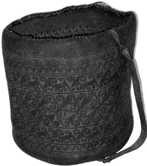
Fig. 7. An old drawstring basket with rows of dog motifs (h. 35 cm); upper Mahakam river area.

A motif's cultural referent and symbolic value may vary with ethno-cultural groups and the types of artifacts carrying it. The “torso” or “person” motif, which the Aoheng routinely plait into drawstring baskets, occurs among the Ngaju on ceremonial hats, under the name of “augury bird,” referring to a female celestial omen-bearing spirit. The “dog” motif of the same Aoheng baskets (Fig. 7), whether or not it refers there to the underworld dragon goddess, occurs on Ngaju ritual hats as the “golden goat,” carried down to this earth by a mythological celestial ancestor (Maiullari 2011). Likewise, the motif of the squatting anthropomorphic figure with raised arms certainly does not carry the same symbolic value on a sleeping mat or ordinary basket as it does on a ritual hat or a baby carrier (Sellato 2012, 2017a, 2018).