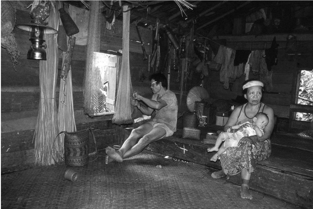
Fig. 1. Inside a Dayak farmhouse; note the broad variety of plaited objects.