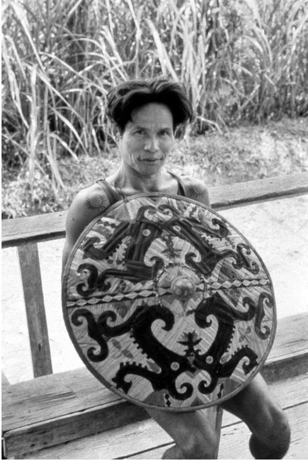
Fig. 2. A wide sunhat of pandanus with motifs of dragon-dog heads; Aoheng people.

Ordinary objects, however, may also have a specific role in religious practices. Fishing utensils, such as a fish trap and fish scoop, can be used in rituals to “catch” invisible symbolic riches (Couderc 2012). They may also be diverted from their primary function to become part of the ritual kit. For example, the garong baskets of the Iban serve no daily function as containers, but, instead, are used only during the Gawai Antu festival to memorialize the recent dead (Sandin 1963, Sather 2012, Bléhaut 2012).