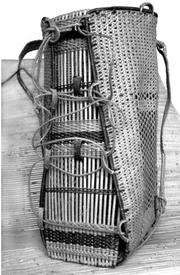
Fig. 3. Large burden basket of rattan with shoulder straps (h. 63 cm); Kenyah people.

A salient contrast between orthogonal and diagonal (or straight and oblique) plaitwork may point to separate plaiting traditions, as these techniques are found applied either to distinct types of crafts by the same ethno-cultural group or to the same type of craft by different ethno-cultural groups (see Sellato 2012).