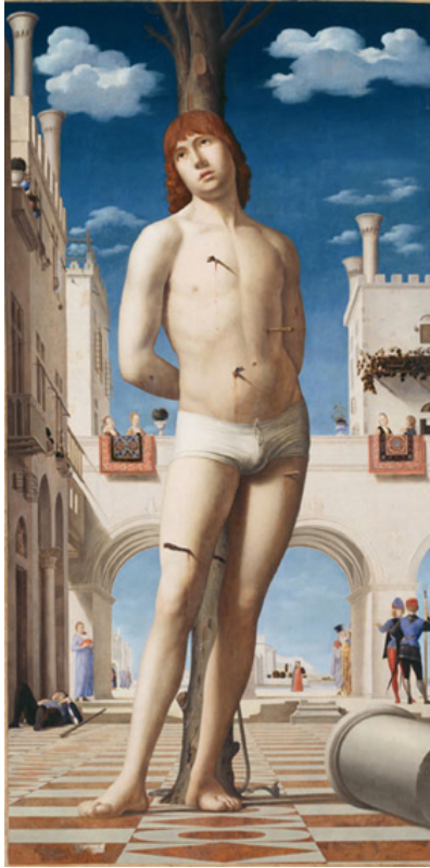
Antonello da Messina, St. Sebastian , tempera on wood transposed onto canvas, Dresden, Gemäldegalerie, 1476

And now this metaphysical and religious cosmology became a geometry of space: God, the stars and men found a new place in it, arranged from a unifying and changeable viewpoint. We have come a long way from the absolutes outside of space and the world of Byzantine mosaics, if we think back to Ravenna. This (re)arrangement of space, this new skill of choosing a viewpoint, this technology that soon spread across Europe, helped Copernicus (1473-1543) to "see" the solar system from "the Sun's viewpoint", the new prospettiva of modern science 7 .