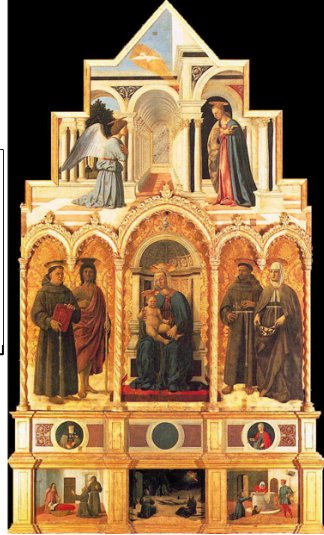
Piero della Francesca, Polyptych of Perugia , 1470, Perugia, National Gallery of Umbria,