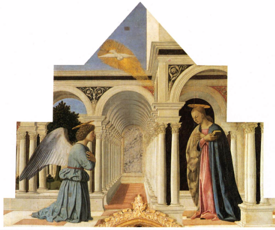
Polyptych of Perugia, upper register (see above)

The Annunciation that decorates the cyma of this large altarpiece is painted in a space that is not closed by the frame. Perspective thus makes it possible for Piero to give the illusion that what we see, which is cut into by the imposing stepped frame, is only one part of a much larger space, that of a cloister. Unlike in the middle register, where the golden background gives spatial unity but little depth, and in the lower register, a traditional predella where each scénette has its own closed, unified perspectival narrative space, the upper register shows an infinitely large space, to the sides (each architectural element exceeds the frame) and also in depth (the succession of columns is impressive). Gabriel is kneeling before Mary, looking up at her. Mary has her hands crossed and her head slightly bowed in a sign of acceptance. She is not in front of the architecture, as Gabriel is, but under a protrusion from the building. The reader should observe the clusters of columns to the right and left of the figure of Mary: they are the only elements of the painting placed in the foreground. The Virgin is directly opposite Gabriel, at the same distance from us, as we can see from their feet being on the same white strip of paving, behind the plinths. What is the visual effect of this arrangement of the figures in the architecture?