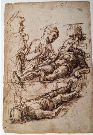
Andrea Mantegna, Study for the Dead Christ , pen and brown wash on paper, 1460-1465. Milan, private collection

For a fuller understanding of the picture, let's start by looking at the studies. Among pictures recently attributed to Mantegna and published, we can see the research of a perspecteur, with a fondness for foreshortened corporeal representations, as in the preliminary drawings for the Dead Christ : the drawing is a study of Christ's body seen from the feet and then from the head, but always at a slight angle to the plane of representation, and not at 90 degrees, as in the final painting.