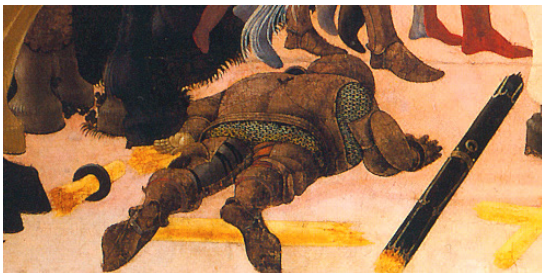
Paolo Uccello, Battle of San Romano , detail, 1456, tempera on wood. London, National Gallery

During the same years, Paolo Uccello used the same technique. When his wife used to call for him at night, Vasari tells us, Paolo would join her in bed murmuring: "Oh! this perspective is such a lovely thing!" ... The elongated bodies in the Battle of San Romano give the battleground all its depth.