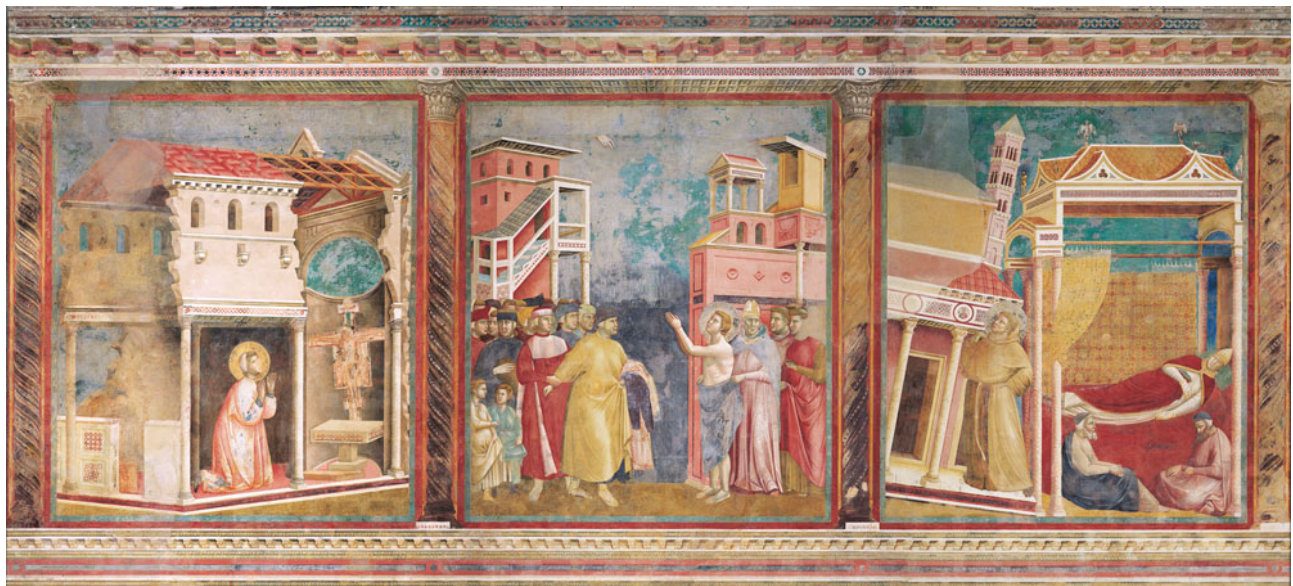
Giotto di Bondone, Life of St. Francis , fresco, around 1290. Assisi, Basilica of St. Francis

The problem of depicting the scenes where the narrative figures were to be placed became a central issue for painters from the late 13 th century onwards. Giottoesque "boxes" (dolls' houses with one wall missing, exposed to the viewer) are scenes whose purpose is to contain the historia and to render intelligible its theological teachings. In a contiguous arrangement, the spatial scenes (boxes, landscape, hills) punctuate the narrative – we will come back to this later.