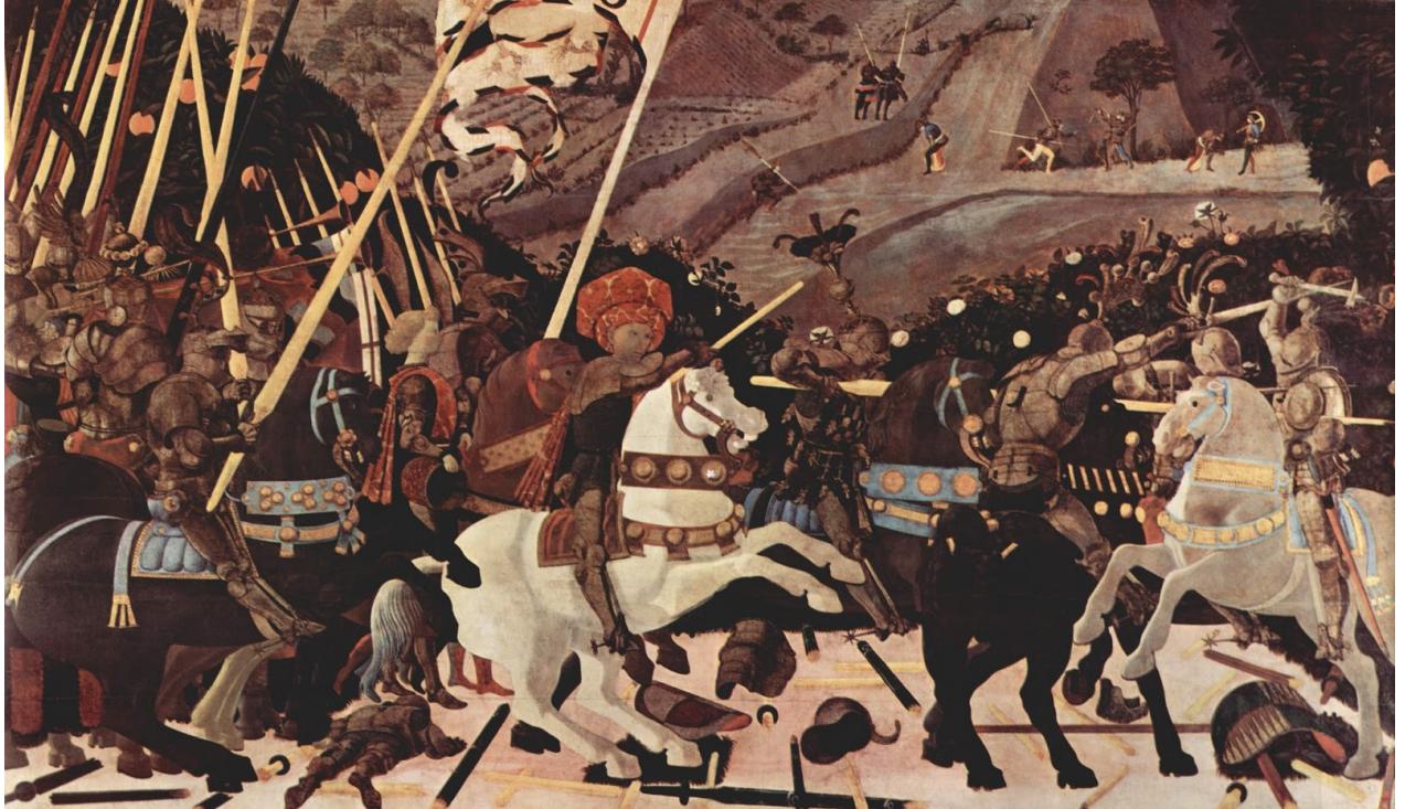
Paolo Uccello, Battle of San Romano , 1456, tempera on wood. London, National Gallery

In conclusion, in this section we have tried to reconstruct a constitutive path of the power of the mathematics of infinite spaces of all the possibilities of physics, even when these possibilities are given in terms of (quantum) probabilities, starting from a theological origin that found its first symbolic expression in 14 th century painting.