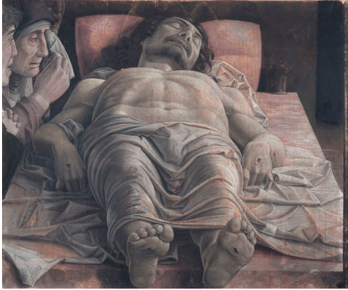
Andrea Mantegna, The Dead Christ , tempera on canvas, Milan, Pinacoteca di Brera, 1490

The head is resting on a cushion, also in light pink marble, so as not to detract from the mineral chromaticism of the whole of the painting (body, sheet and bed, everything is in stone). On the left, three figures mourn the corpse. At the bottom, is where we are. We look at this body and the painter has taken great care to show all of it: the soles of the feet and the backs of the hands torn by the nails, the lateral malleoli and the fibula and then, on the torso, the navel, the stigmata in the right side and the chest. Finally, on the face, the chin, mouth, nose, eyes, eyebrows, forehead and hair, everything is perfectly visible and identifiable.