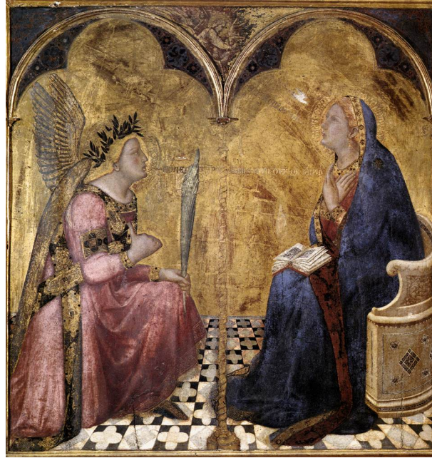
Ambrogio Lorenzetti, Annunciation , tempera on wood, Siena, Pinacoteca Nazionale, 1344.

In this Annunciation there is a column, often a symbol of Christ, very substantial at floor level and becoming fainter towards the top where it overlays and obscures the receding axis , one could say, at infinity, an explicit reference to God. Here, in 1344, we have an extraordinary innovation: a rigorously-drawn projective space. And then, through the effect of the geometry of this floor that goes from (wo)man to God, a new scene unfolds: God has His place here, hidden, far away at infinity, but present in the story that is being told. The Madonna, too, has a new human depth: her solid, three-dimensional body ushers in the expression of an emerging humanism. Perspective introduces God as the actual limit, at infinity, thus as the limit of a space that everything encompasses, including human spaces that replenish themselves. And the very first pictures painted in prospettiva were annunciations, that unique scene where infinite meets finite 6 . Then, with Piero della Francesca, this metaphysical dissertation in paint went on to also become a technique, without necessarily losing its religious essence. Piero's book De Prospettiva Pingendi (1475) is actually a treatise on "practical" projective geometry, the most significant mathematical text of his time, as Vasari was to write.