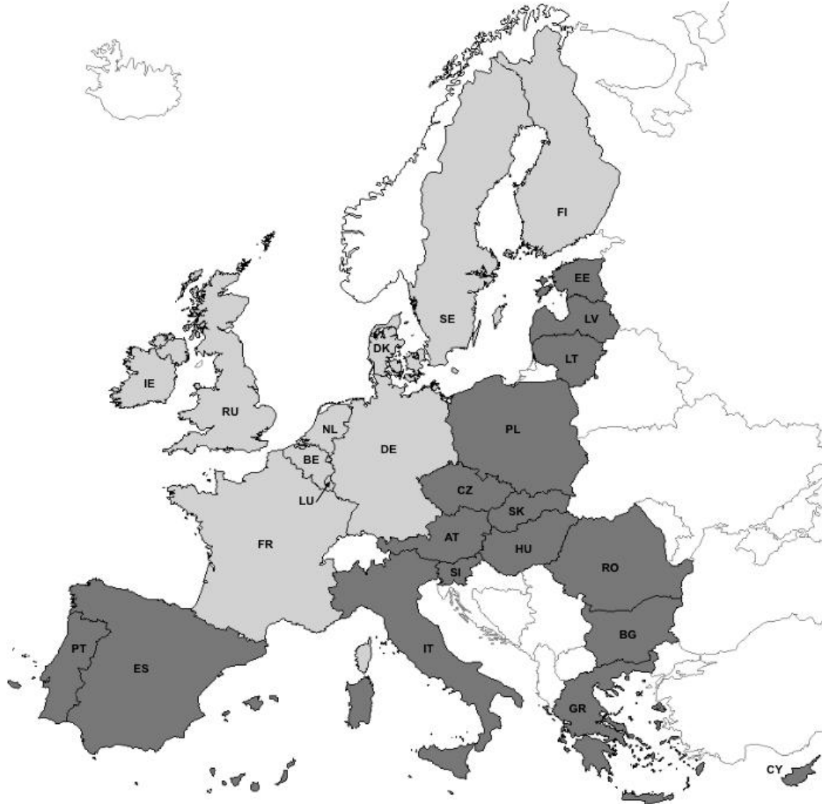
Map 1: The working class in European countries

Note: on average the working class represent 43% of people in work in Europe. Population: People in work aged between 25 and 65, EU 27 (excluding Malta).