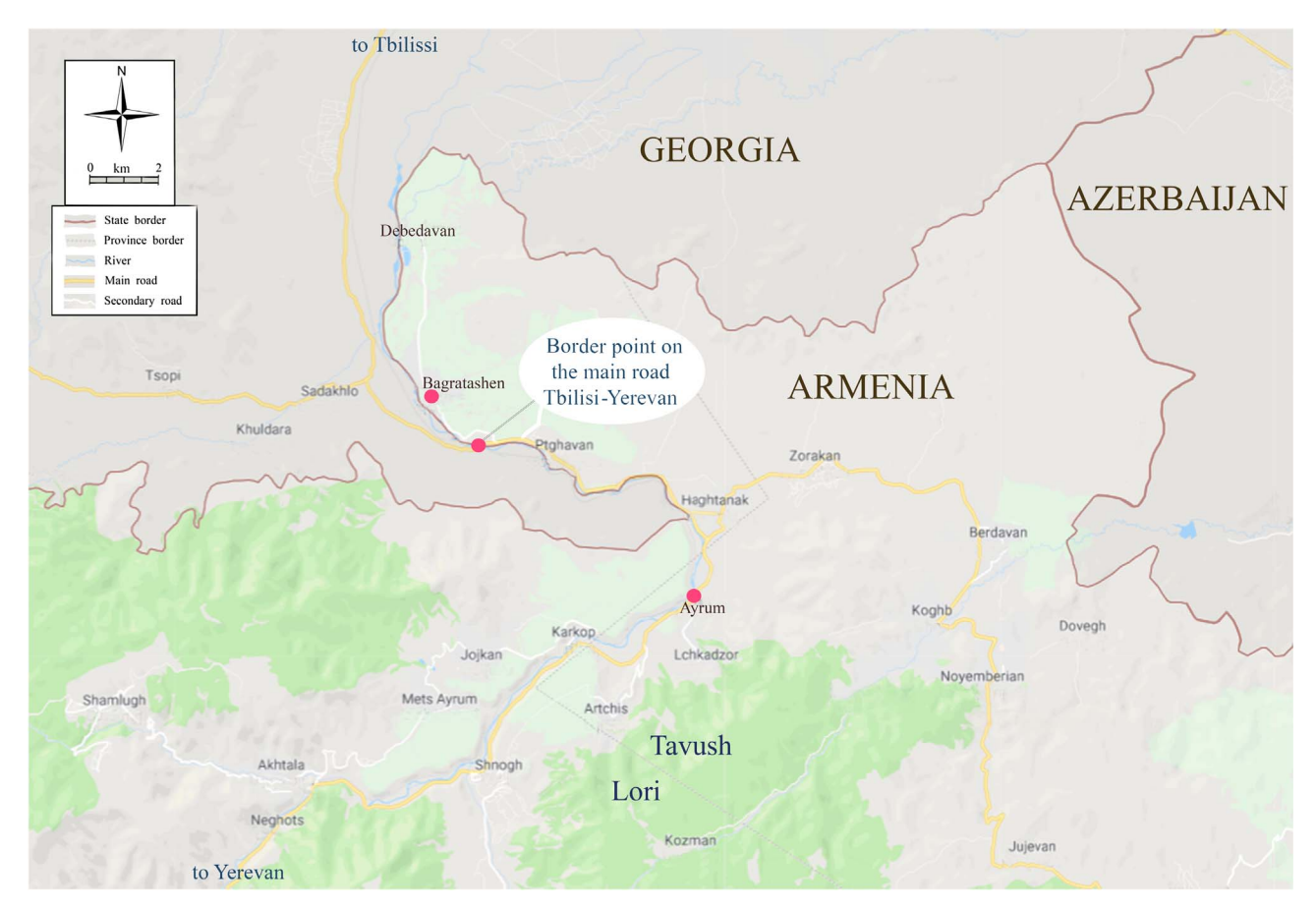
Figure 3. Location of the sites where Aedes albopictus was recorded in 2016–2018, north Armenia.

Interestingly, the field mission in 2016 was organised with the knowledge of the presence of Ae. aegypti at the border point with Georgia, where it had been recorded in 2015, 20 km away in a direct line towards the north [1]. Interestingly, no Ae. aegypti were observed, but instead Ae. albopictus . This unexpected observation means that we should expand some results geographically only with extreme caution.