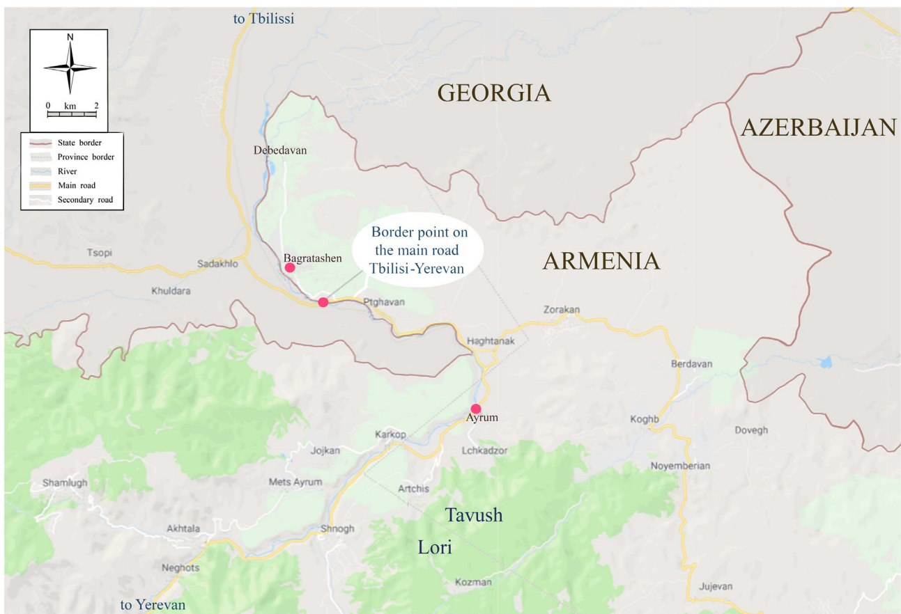
Figure 3. Location of the sites where Aedes albopictus was recorded in 2016–2018, north Armenia.

Interestingly, the field mission in 2016 was organised with the knowledge of the presence of Ae. aegypti at the border point with Georgia, where it had been recorded in 2015, 20 km away in a direct line towards the north [1]. Interestingly, no Ae. aegypti were observed, but instead Ae. albopictus . This unexpected observation means that we should expand some results geographically only with extreme caution.