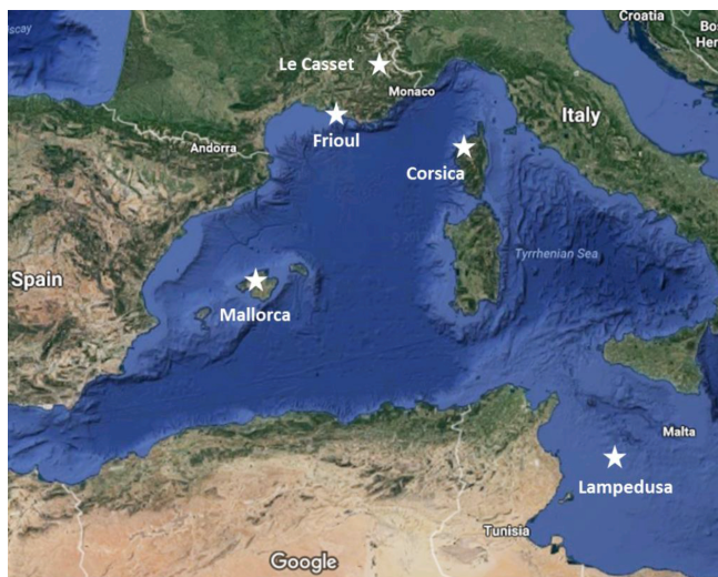
Figure 1. Location of the CARAGA sampling sites in the western Mediterranean Basin: Le Casset, Corsica, Frioul, Mallorca and Lampedusa.