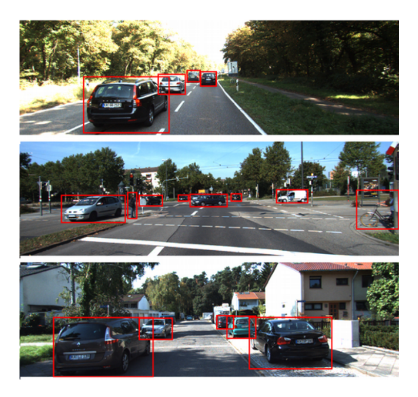
Fig. 1. Examples of images provided by KITTI [4].

This section presents a benchmark of the probabilistic transformations in the framework of the object association system for autonomous vehicles. The aim is to assign detected objects in the scene (targets) to known ones (tracks). The transformations have been evaluated on real data.