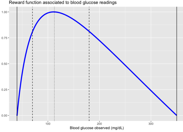
Figure 1: Reward function for BG levels inspired by [4], where the authors proposed to build a function centered at BG level 112.5 mg/dL and symmetric through reference levels, shown with vertical lines.

where discount factor \gamma \in (0, 1) is chosen by the user and indicates how much long-term rewards matter. Note that the standard bolus advisor from equation 1 belongs to \Pi .