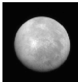
Figure 1: Example of a LORRI observation

This work is focused on the most recent mission to have encountered the Jovian moons - New Horizons. On its way to Pluto, the spacecraft spent three months observing Jupiter and its moons in 2007 with the LORRI (LONg-Range Reconnaissance Imager) camera [5]. Combining all the images captured during the Jupiter phase of the mission, the whole surface of Europa is accounted for.