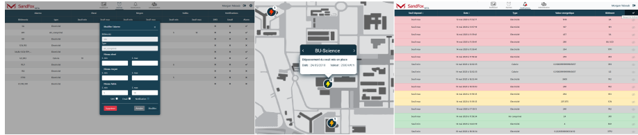
Fig. 2. left, Dialog box for creating an alarm; centre, display of notifications on the Map; right, interface listing the information of each detected anomaly

Users can define limits for energy values that buildings should not exceed. They can define three minimum and maximum values for the same alarm (cf. Figure 2, on the left). This helps to determine the severity of the problem. If one of the limits is exceeded, the user is then informed of the anomaly on the map: a dot appears on the concerned building. This dot displays the type of energy, the number of anomalies and is coloured according to the severity of the anomaly (see figure 2, center). The user can click on it if he wishes to have more information on the problem. He can also go to the notifications page where he will have the list of all the anomalies, with the detail of the values (cf. figure 2, on the right).