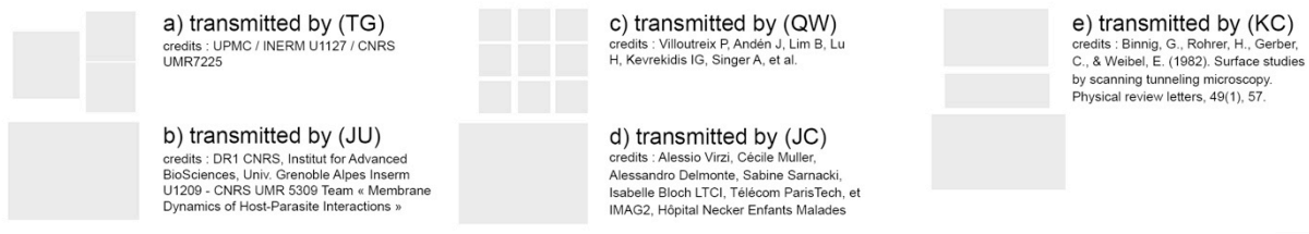
Figure 1. A selection of « beautiful images of science » given by five of our actors. a) neurons culture, imaged to identify « pre-nodes ». b) Colored movie frames obtained with data fusion algorithm of molecular signals and morphology during the DV patterning of Drosophila embryo. c) toxoplasmosis imaged by fluorescent microscopy (white structures) that “looks like flowers”. d) dynamic 3D visualization of a human pelvis, that can be rotated in three axis. e) an “image of great importance” in the “scientific community” of (KC): “that was the first time we « saw atoms. »”. Atoms are the dark dots, and dark lines shows levels of electronic measures that attest “presence of atoms”. Retrieved from Binnig, G., Rohrer, H., Gerber, C., & Weibel, E. (1982). Surface studies by scanning tunneling microscopy. Physical review letters, 49(1), 57.