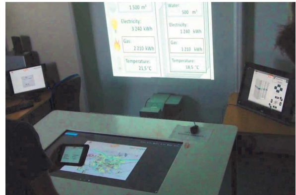
Figure 2. The use-case setup (from [4])

The lack of a spatial hierarchy is typical of distributed environments where the association between actions and locations depends on the deployment of the resources rather than on predefined structural properties of an activity, and distinguishes this dimension from the other two. It’s possible to conceive hierarchical interaction spaces where locations are grouped to support sets of connected activities, tasks or actions. In our view such hierarchy does not add interesting properties to the ambient, and we shall not elaborate on this.