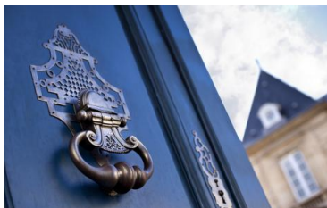
Fig1. The “Grandes Ecoles” or the higway to professionnall success

For instance, imagine that you are in some of the oldest club in town, where members of nobility meets discuss about their business around a glass of whisky. Imagine if a young manager get into this club and starting by distribute his business card, tell everyone that he is only here for networking, to enhance his