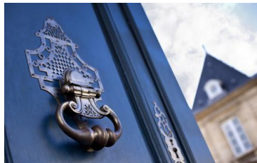
Fig1. The “Grandes Ecoles” or the higway to professionnall success

For instance, imagine that you are in some of the oldest club in town, where members of nobility meets discuss about their business around a glass of whisky. Imagine if a young manager get into this club and starting by distribute his business card, tell everyone that he is only here for networking, to enhance his