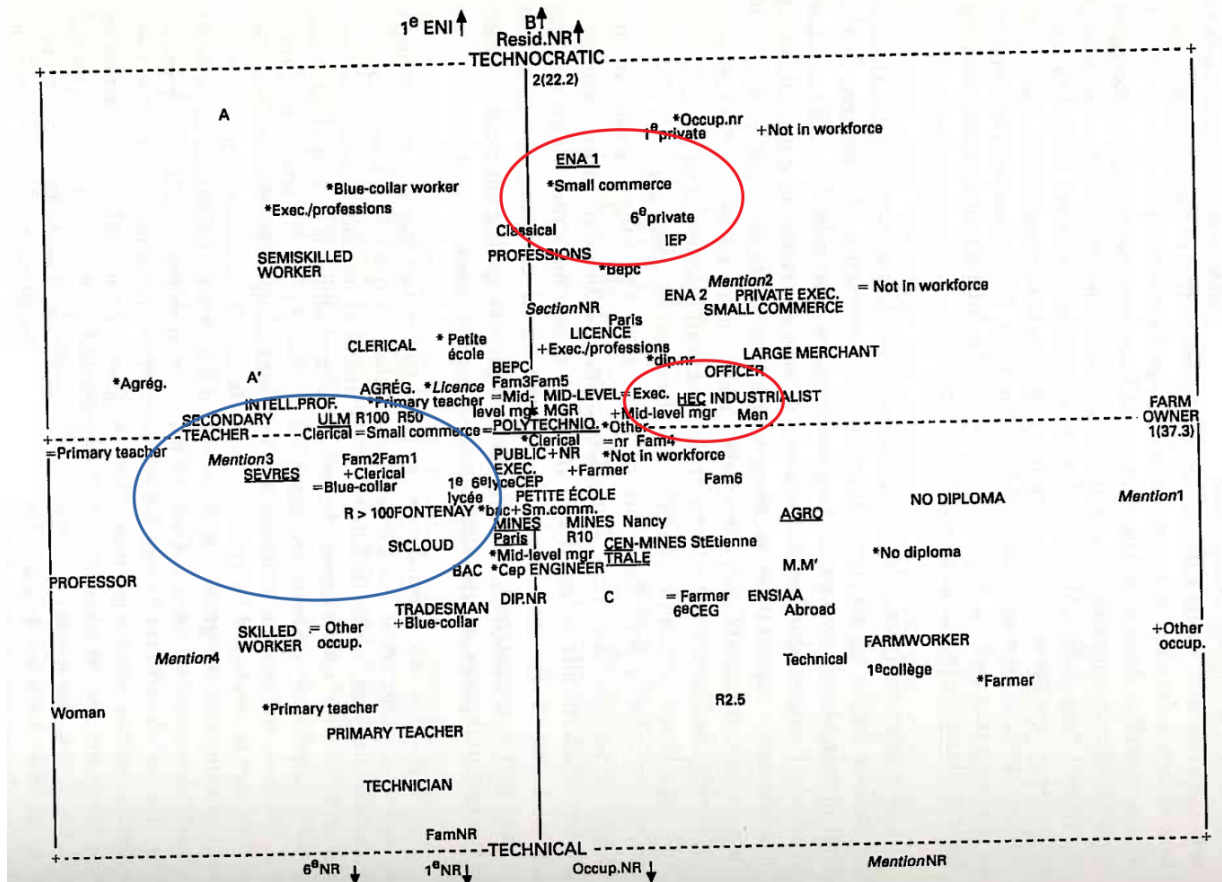
Fig4. The Grandes Ecoles field at the mid 1980's (Bourdieu, 1998)