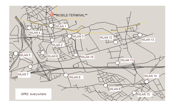
Fig. 2. Access networks' topology

output of the CanuMobiSim simulator gives the corresponding position of the mobile user at each moment in time (see Fig.1).