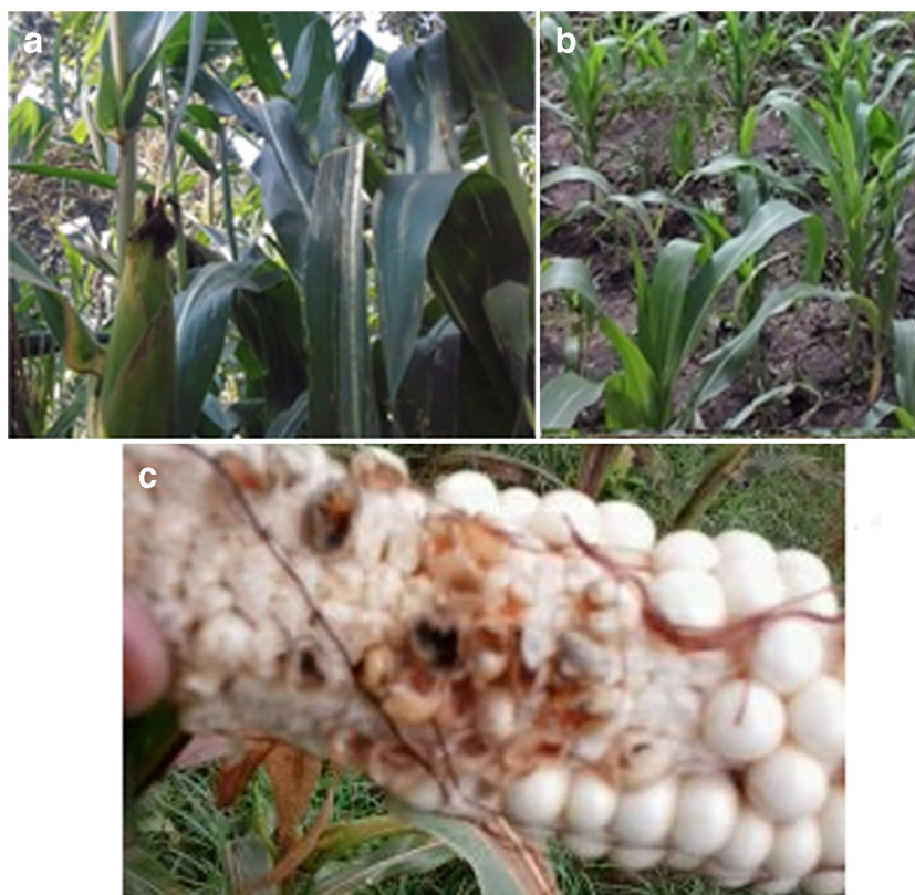
Fig. 1 Images showing comparative effects of arthropod pests on maize crops. a Healthy, unaffected maize. b A stunted maize stand due to attack by arthropod pests. c A maize cob destroyed by arthropod pests.

Organic or non-chemical-based farming is practiced by approximately 10% of farmers in the study region. On the farms sampled in this study, organic farming is defined as non-use of pesticides or herbicides; application of farmyard enrichments instead of inorganic fertilizers for soil improvement; mixed or rotational cropping; multiple cover-cropping; occasional field fallowing; and maintaining live indigenous hedgerows and woodlots. Conversely, conventional or chemical-based farming entailed the use of synthetic fertilizers, pesticides, and other agrochemicals to control pests, weeds, and crop diseases; no crop rotation; monocropping and often, no uncultivated margins. Samples were collected six times between 2016 and 2017, i.e., once at each of three crop stages in the short-rain season and once at each of three crop stages in the long-rain season. The crop stages were early crop (from germination to first weeding), mid-crop (from second weeding through flowering to corn-ear formation), and at mature-crop (from corn hardening to harvesting). Four samples each of three plant types were collected per farm for isotope analyses, i.e., maize was the target \text{C}_4 plant type; legumes (intercropped with maize e.g., beans and other pulse crops) were the target