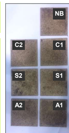
Photographs of fiberboards produced

d, density; Shore D, surface hardness; \sigma_f , flexural strength at break; E_f , elastic modulus; TS, thickness swelling after 24 h immersion in water; WA, water absorption after 24 h immersion in water.