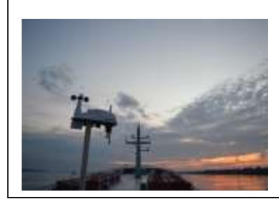
Figure 3: Weather Station - DAVIS - Vantage - Vue, on the Amazon River in July 2016.

With the choice of Morlet WT and the measurements of 120-hours temporal series for obtaining the power wavelet spectrum, temperature, and global wavelet spectrum, we obtained results within 95% confidence. The support used was [10], WT modified routines.