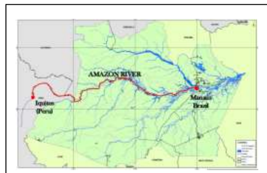
Figure 1. Conceptual Map of the Expedition - Amazon River (Peru-Brazil), 1 st Part 26 to 30 July 2016.