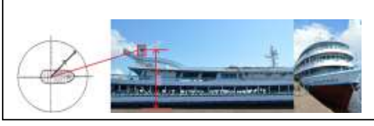
Figure 2: Lagrangian Footprint Model [18], Weather Station - DAVIS - Vantage - Vue, the boat M / Monteiro II, 300\text{ m} \leq R \leq 500\text{ m} , between unstable and stable conditions in July 2016.

and 106, as well as the graphics of rhythmic analysis of the types of the climate and systems, responsible for atmospheric dynamics of the period according to satellite images with information from [7]. Analysis of the Wavelet Transform from Morlet, following the methodology of [8], as the spectrum energy associated with the flow measures.