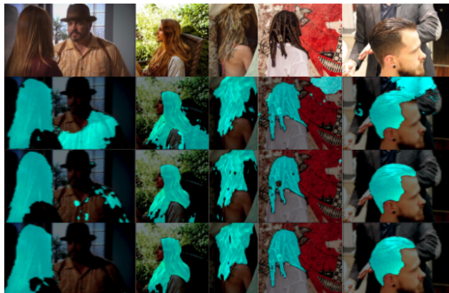
Figure 3: Challenging examples in Figaro1k. First row: Input image. Second row: Segmentation results without detection stage (only Stage2). Third row: Segmentation results by ImageNet pre-trained DeepLabV3+ [3]. Fourth row: Segmentation results by our two-stage model. Many tiny isolated false positives can still be observed on the man’s shirt in the first image of DeepLabV3+ results.

Acknowledgement: This work is sponsored by Région Auvergne-Rhône-Alpes. We are grateful to the NVIDIA corporation for a Titan Xp GPU donation.