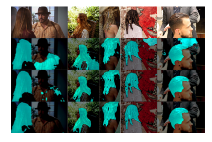
Figure 3: Challenging examples in Figaro1k. First row: Input image. Second row: Segmentation results without detection stage (only Stage2). Third row: Segmentation results by ImageNet pre-trained DeepLabV3+ [3]. Fourth row: Segmentation results by our two-stage model. Many tiny isolated false positives can still be observed on the man's shirt in the first image of DeepLabV3+ results.

Acknowledgement: This work is sponsored by Région Auvergne-Rône-Alpes. We are grateful to the NVIDIA corporation for a Titan Xp GPU donation.